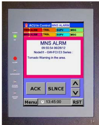
Figure 1 NGA Screen with MNS Alarm Event

Figure 1 illustrates the NGA Screen with an MNS Alarm Event.